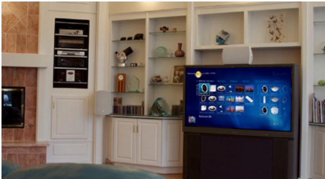
The living room features a big-screen TV and Media Center extender for accessing Lifelware control and entertainment.