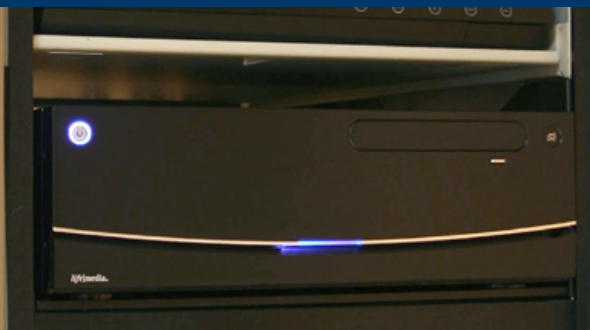
A rack-mounted Life|media media server provides convenient, multi-room access to digital entertainment.