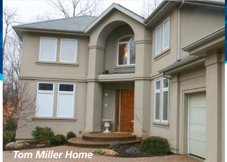
Tom Miller Home

“Lifelware gives us the flexibility to do what we want with the products the customer wants, all through a seamless interface that's extremely user friendly.”